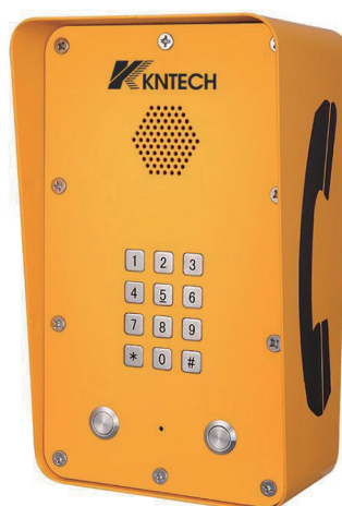
Highway Emergency Phone